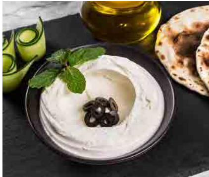
LABNEH Strained Yogurt Extra Virgin Olive Oil