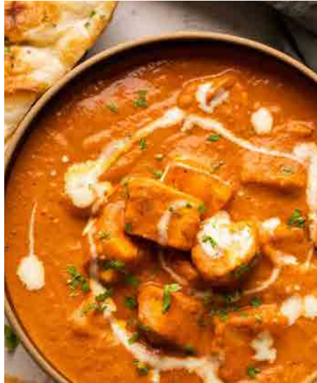
PANEER BUTTER MASALA Homemade Cottage Cheese Cooked in Onion & Tomato Gravy Topped with Fresh Coriander