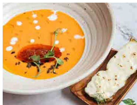
CREAMY TOMATO Topped with Sundried Tomato Pesto

100G Smoked Salmon THB 180.- 100G Shrimp THB 180.- 100G Grilled Chicken THB 120.-