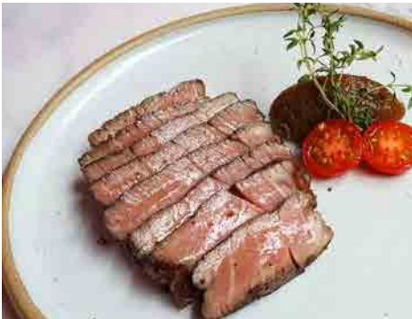
BEEF TENDERLOIN 150G