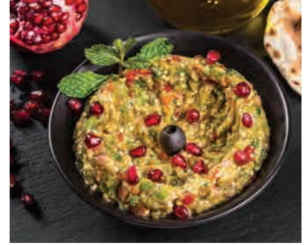
BABAGHANOUJ Smoked Eggplant Puree Vegetable