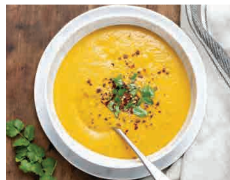
LENTIL SOUP Lentil | Cumin Served with Crispy Bread & Lemon Wedge