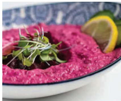
BETROOT MOUTABAL Smoked Eggplant Puree Tahina | Beetroot