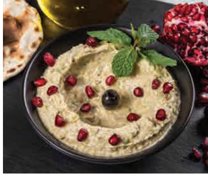
MOUTABAL Smoked Eggplant Puree Tahina | Pomegranate