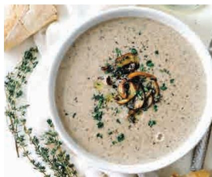
MUSHROOM SOUP Champignon | Truffle Oil