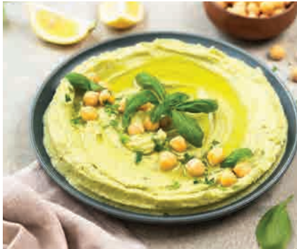
HUMMUS BASIL Chickpea Puree | Basil Tahina | Lemon Juice