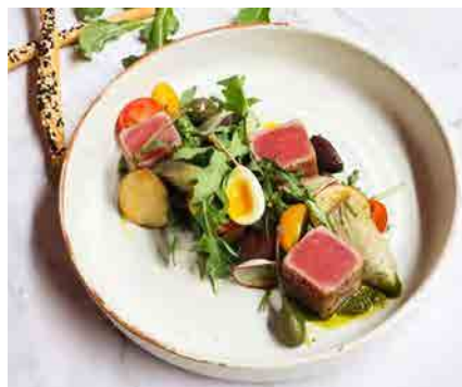
SALADE NIÇOISE 100G Tuna loin | Arugula Quail Eggs | Artichoke Kamalata Olives | Caper Berries