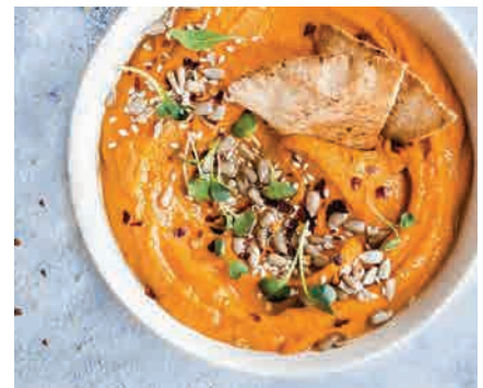
SPICY TAHINEYE Red Chili Paste | Tahina Signature Spices