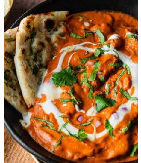
BUTTER CHICKEN 180G Charcoal Grilled Chicken Cooked in Buttery Tomato Sauce