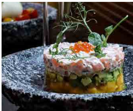
SALMON TARTARE 100G Salmon Fillet | Mango Avocado | Ikura