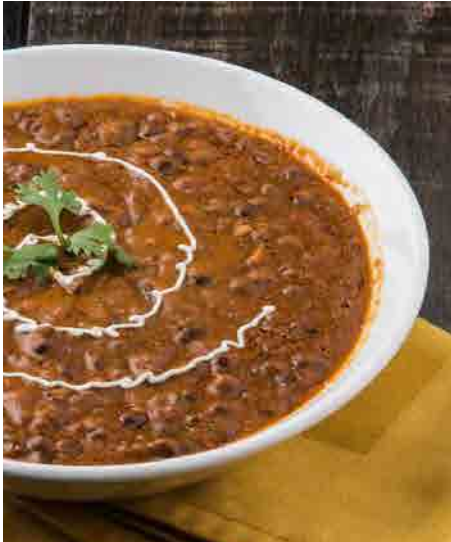
DHAL MAKHANI Traditional Lentil Dish