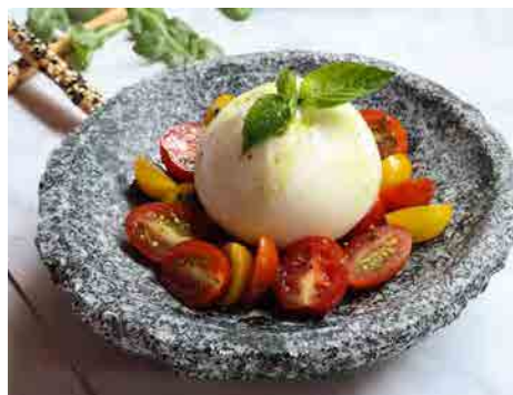
BURRATA Heirloom Tomatoes | Tarragon Rye Croutons Flora's Burrata Sauce