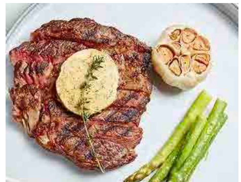
RIB EYE 350G