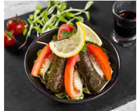
VINE LEAVES Vine Leaves Stuffed with Rice & Vegetables Topped with Pomegranate Molasses