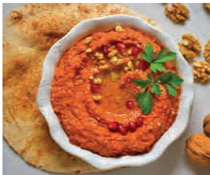
MUHAMMARA A Spicy Dip Made of Walnuts Red Bell Peppers Pomegranate Molasses