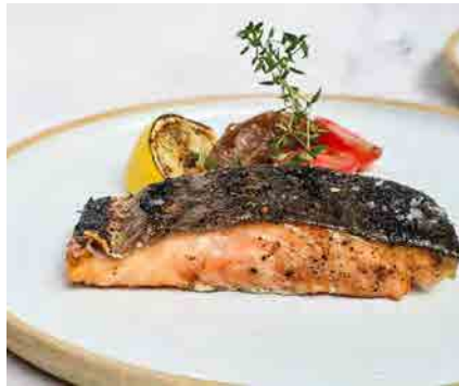
GRILLED SALMON FILLET 150G