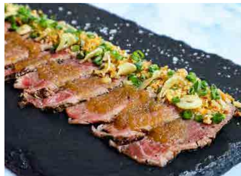
BEEF TATAKI 100G Lightly Seared Peppered Beef Tenderloin Served with Onion Salsa & Ponzu Sauce