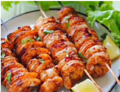
SHRIMP TANDOORI 180G Tandoori Grilled Shrimp Vegetable