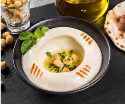
HUMMUS THB 160.- Chickpea Puree | Tahina Lemon Juice