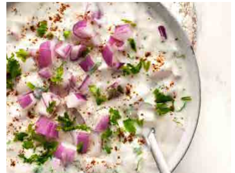
RAITA Homemade Yogurt with Onion Tomato | Coriander | Chili Cumin Powder