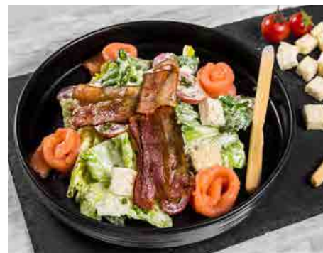
CAESAR SALAD THB 320.- Romaine Lettuce | Bacon Cherry Tomato | Parmesan Cheese

100G Smoked Salmon THB 180.- 100G Shrimp THB 180.- 100G Grilled Chicken THB 120.-