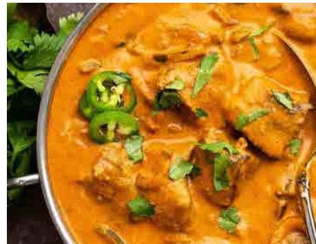
LAMB TIKKA MASALA 180G Boneless Lamb Shoulder Cooked in Rich Masala Onion & Tomato Topped with Fresh Coriander